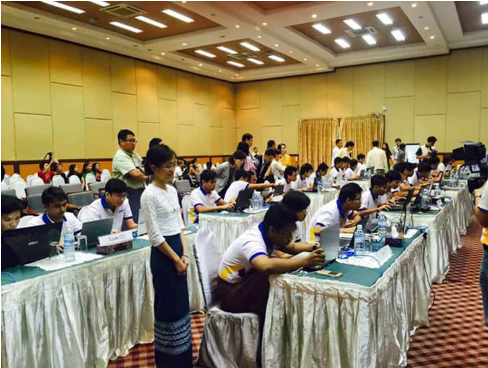
ICT competition in university Students